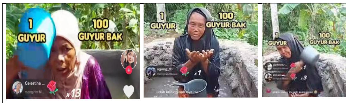
Figure 1: Live Tiktok mud bath played by the elderly

After examining various prior studies, it is evident that a notable gap exists in the research concerning the motivations driving content creators to seek donations or financial support from their audiences. Additionally, there is a dearth of investigation into the peculiar phenomenon of mud bathing during live broadcasts on TikTok. Consequently, this study has been undertaken with the primary objective of delving into the intricacies of live mud baths. The aim is to bridge existing knowledge gaps and offer fresh perspectives that can contribute to a more comprehensive understanding of human motivation and behavior. By shedding light on the motivations behind soliciting financial support in the realm of content creation and exploring the uncharted territory of mud bathing in TikTok live broadcasts, this research endeavors to enrich the scholarly discourse. The findings from this study are anticipated to not only fill voids in current literature but also to provide valuable insights that may have practical implications in various fields related to human behavior and digital content creation.